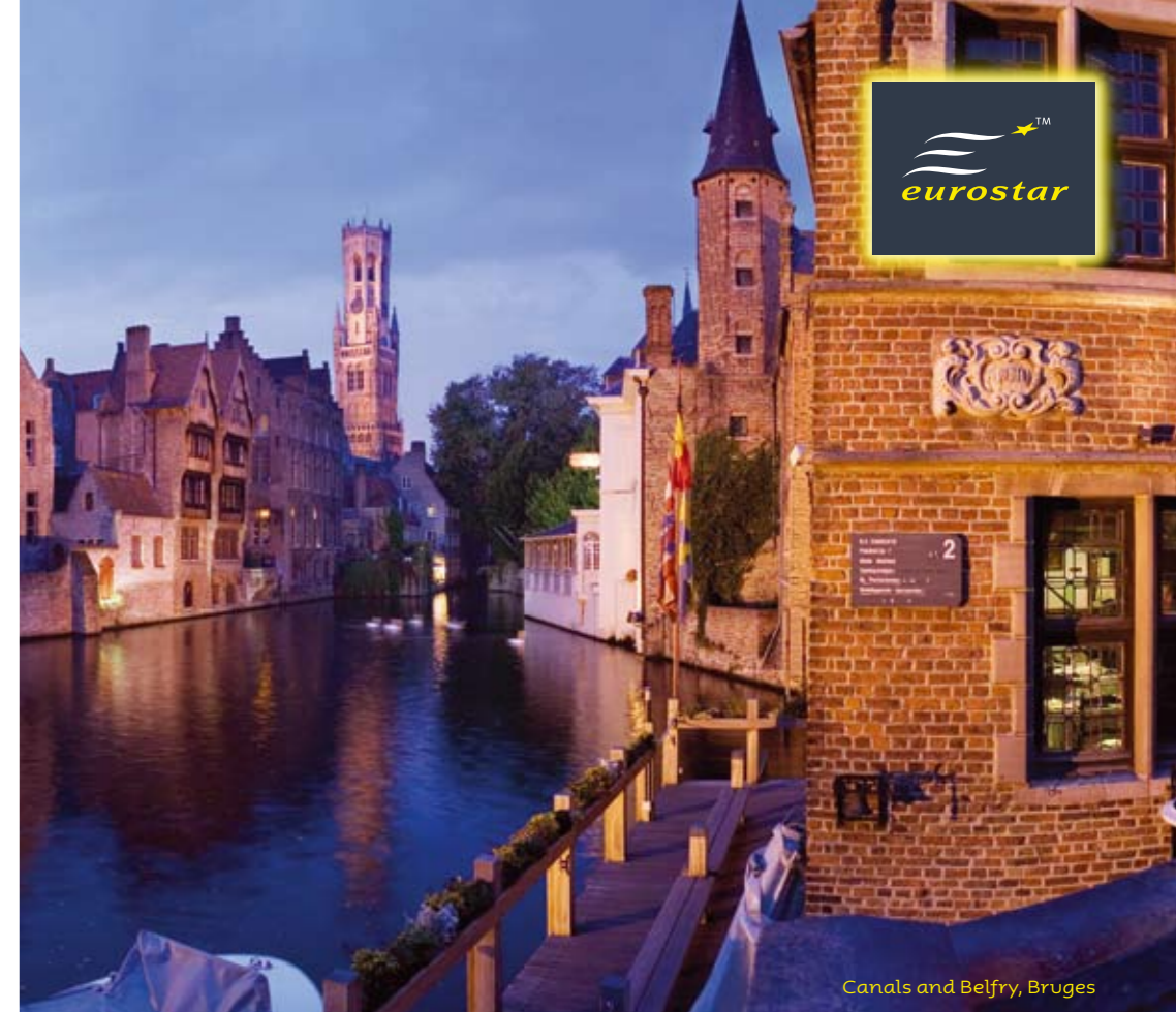
Canals and Belfry, Bruges

PLEASE NOTE: Seats facing forward on a journey from London will be facing backwards on the return journey. However, on rare occasions this may change. All trains are non-smoking.